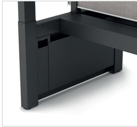
The high capacity vertical riser provides 360° access for power entry in a compact form.