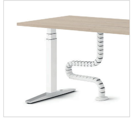
Vertical cable management allows for an uncluttered transition as desk height changes.