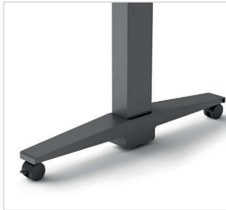
The castor option on single sided desks provides a fully mobile sit-stand desk.