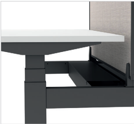
The distinctive H profile design ensures an uncluttered workspace.