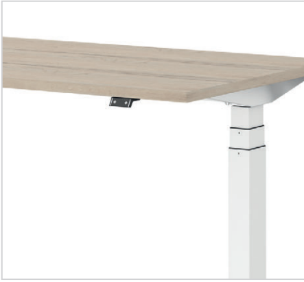
Electric height adjustment, including programmable pre-sets for use at assigned desks.