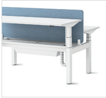
Cable management options including high capacity trays, to ensure all cables are kept tidy underneath the worksurface.