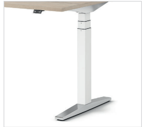
Polished aluminium options for work surface supports and feet for an enhanced aesthetic choice.

For full features and options available for Ratio, please visit hermanmiller.com