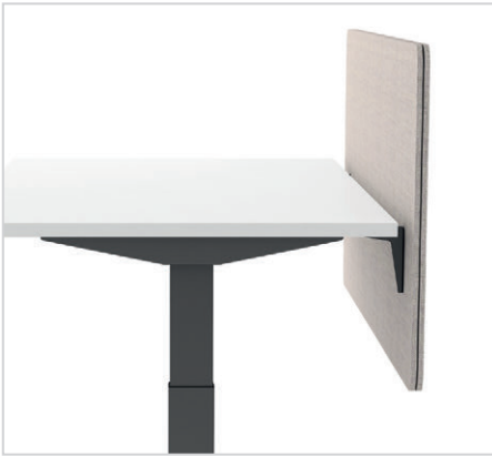
Screen options to create boundaries and add privacy, with fixed screen or the option for one that moves up and down on single desk to afford the user additional privacy.